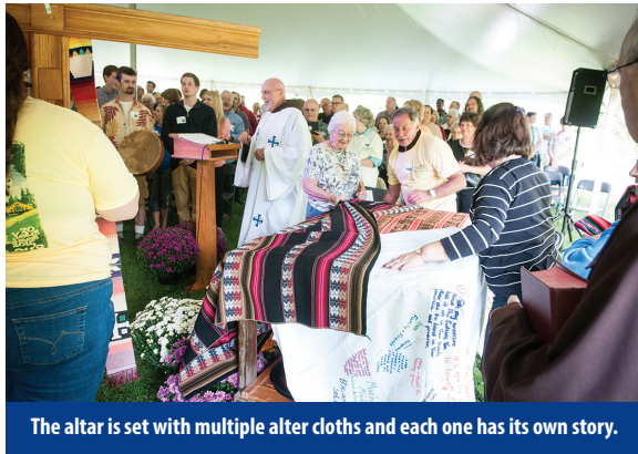
The altar is set with multiple alter cloths and each one has its own story.

From our very beginning, when we longed for a mountain and it, as yet, did not have a place or a name; we had talked about it as a place of learning . We brought with us ways of reflection and movement to action that we had learned in other places. In my early education as a friar, my involvement in the service of the poor, and outreach to the disenfranchised, allowed me to gather with people of other traditions. I began to understand a nonviolent way of looking - observing, judging, and taking new actions for change and growth.