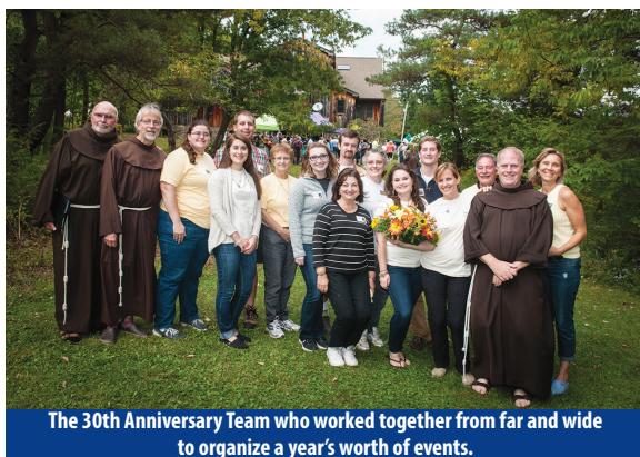
The 30th Anniversary Team who worked together from far and wide to organize a year's worth of events.

I have never been accused of saying something in two words that could take 10! But it seems to me as I look back on these words that were embraced and made real by others, we moved ahead together to find a mountain and form a way of life - which we knew was about "living and learning." We knew that it was about a movement from a hierarchical or vertical way in which we are oppressed, or exercise power to oppress others, to a horizontal/mutual. We are moved to this wonderful experiential sense of Bonaventure's image of a God as a circle or sphere whose center is in each one of us and whose power and service and goodness just wells up and flows out from and to everyone in an infinite and inclusive way.