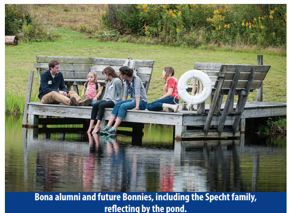
Bona alumni and future Bonnies, including the Specht family, reflecting by the pond.