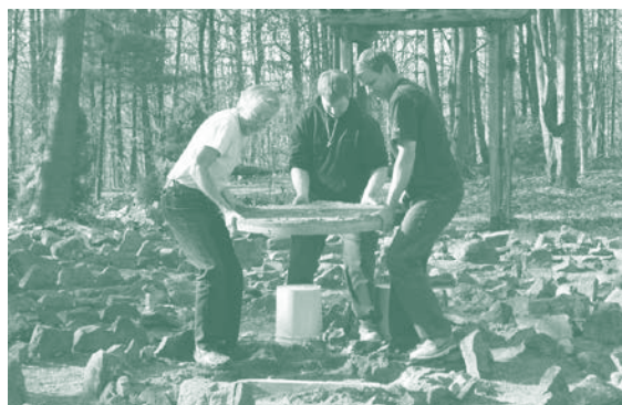
At the Chapel rededication, new names were added to our Labyrinth Garden of Remembrance.