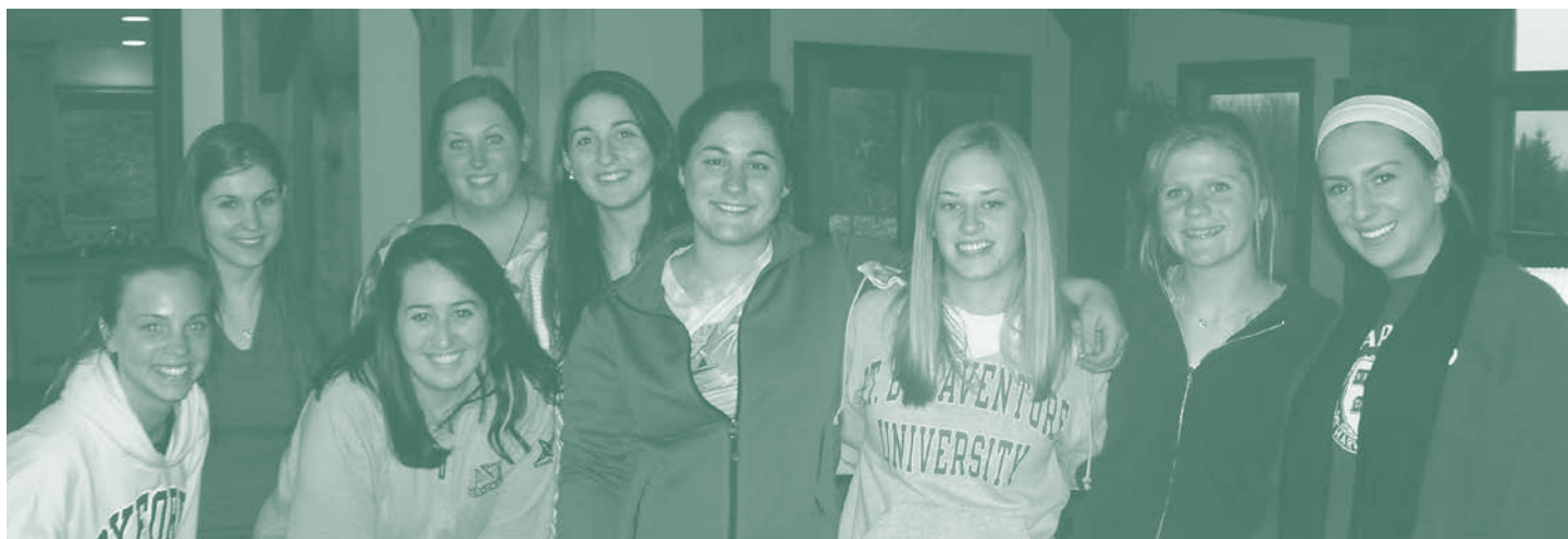
Seniors from St. Bonaventure University's class of 2013 came to the Mountain to reflect on their upcoming graduation and their time at SBU.