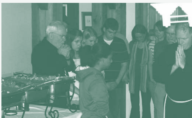
The Mountain Community gathers for Grace.