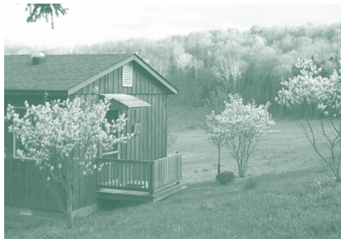
Early spring comes to Juniper Cabin overlooking the meadow.