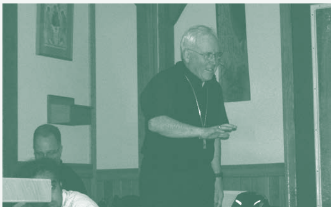
Bishop Malone addresses those gathered at the House of Peace.