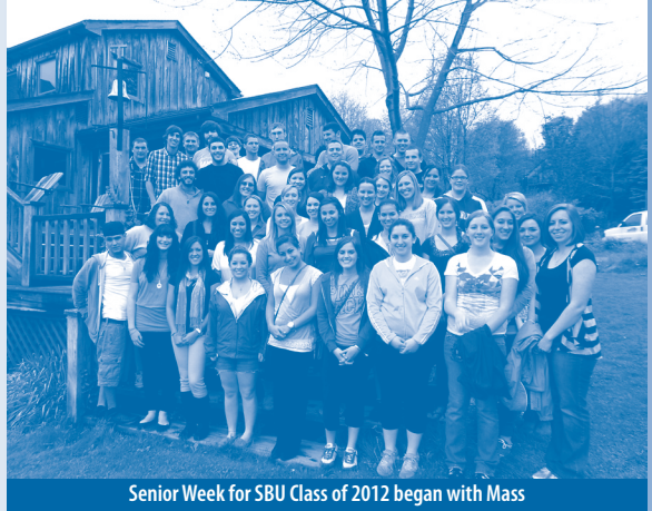
and a cookout on the Mountain