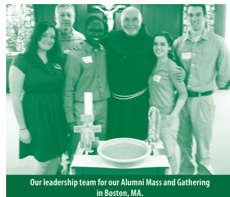
Our leadership team for our Alumni Mass and Gathering in Boston, MA.