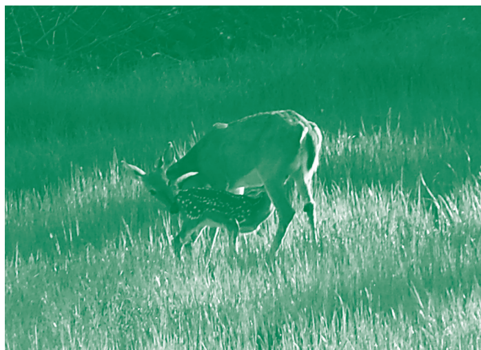
A doe and her fawn stand in our new meadow in the evening's light.

Come and enjoy summertime on the Mountain! Let the Mountain be part of your summer! Let this "greening" join you in your home and workplace so that our moments in shade might witness to us that from out of our "tombs" and other times Christ is risen! God goes "before us" into these summer moments and lively times. We will find Christ there, possibly the God of no name, as we listen and allow ourselves to be loved by Mystery, by this moment, by this greening, by this rising light of fields we might look upon, walk in by which we are stirred to dream with all the world. We allow ourselves the lush longings of the shadows for a moment. Trusting their dark green as a promise of tender shoots that rise to bloom soon with a new dawn.