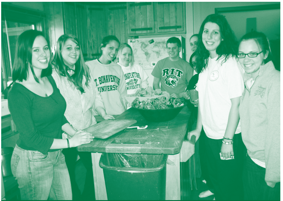
A group of Bonaventure students prepare an evening meal.