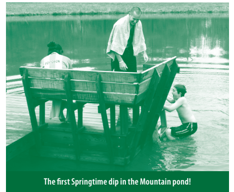
The first Springtime dip in the Mountain pond!