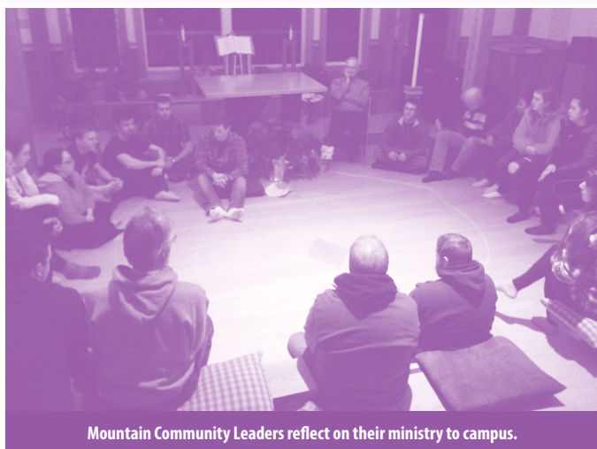
Mountain Community Leaders reflect on their ministry to campus.