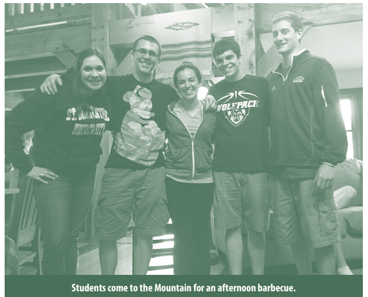
Students come to the Mountain for an afternoon barbecue.