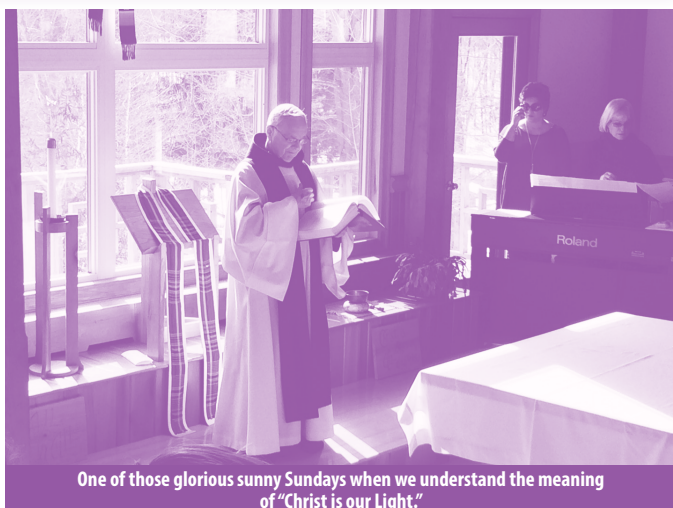
One of those glorious sunny Sundays when we understand the meaning of "Christ is our Light."