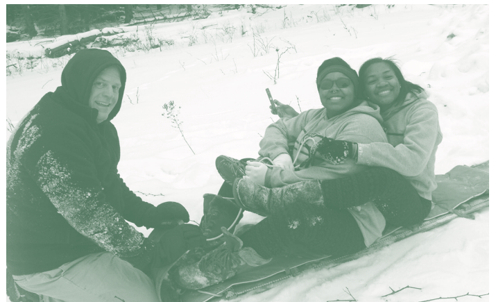
These days people are even taking "selfie" pictures on toboggans.

Once again, we have for you reflections from some of our friends, members of our Mountain family, who live other places, but share life with us here. Take time and savor each one of these.