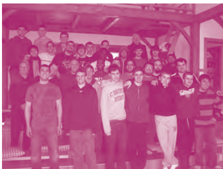
Men's Overnight February 2011