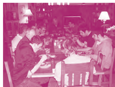
A good meal cooked together is always part of a Mountain evening.

“JUST AS CHRIST WAS RAISED FROM THE DEAD BY THE POWER OF THE FATHER, WE TOO MIGHT LIVE IN THE RESURRECTION OF LIFE” Rom. 6:4