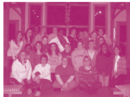
Women's Overnight February 2011