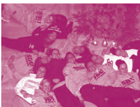
The Women’s Swim Team relax on our Chapel floor for a February 2011 overnight.