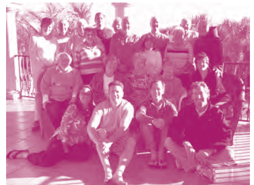
Mountain Friends and family who gathered “in the sun.”

We too are often in two places, but they don’t always seem interrelated. We need to find our way “ here ” right here, wherever here might be, through our Lenten season. Our “walk” as we find our way offers us a deepening interrelatedness. We draw aside for conversion, renewal and reform, not for an artificial sense of perfection in this, a penitential time.