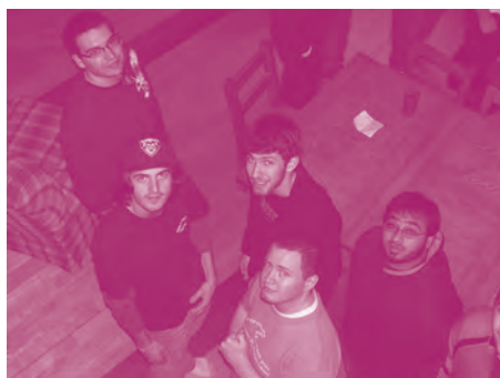
SBU Freshmen in line for supper.