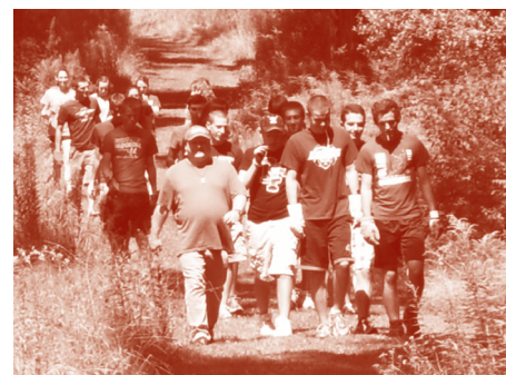
The pictures above are St. Bona's Men's Rugby Team who begin each year with an overnight at the Mountain; relaxing and bonding, meal preparation, long walks in the woods and deep personal sharing at Mass. This has become a tradition for a number of our teams and other groups who are seeking growth with one another.