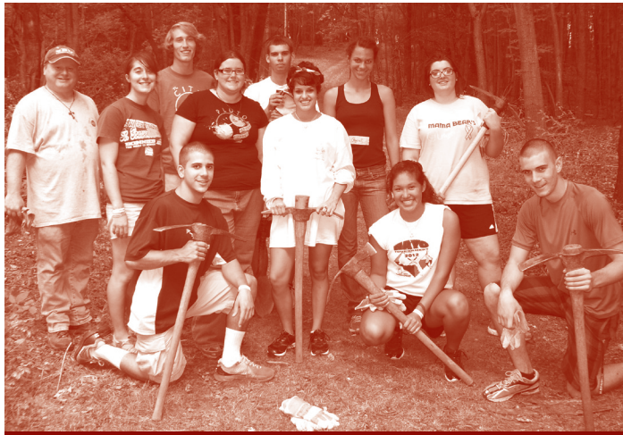
Bona students came to the Mountain to participate in the “Day of Involvement.”

The vistas before me here on the Mountain and off from La Paz draw me into a prayer, seeing “the more” for all of us with a deep and peaceful smile. We then move more easily to offer each other what we are inclined to hold back because of our fears.