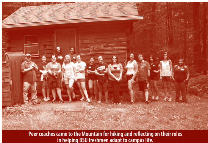
Peer coaches came to the Mountain for hiking and reflecting on their roles in helping BSU freshmen adapt to campus life.